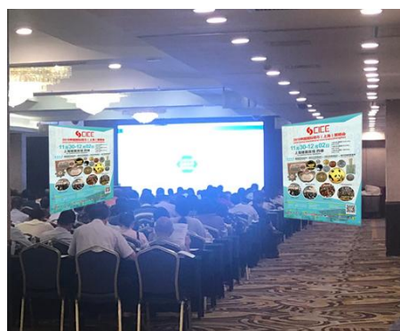
展厅内 KT 板 Show Room Inside KT Board